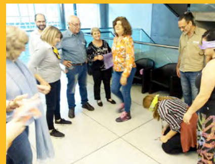
Blind volunteers and mute workplaces – the challenges are big with the volunteer work. – Humour helps in this, just as this exercise shows.